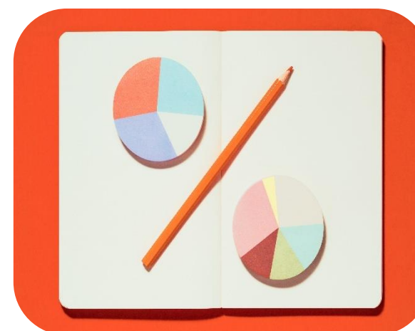
Division of responsibility